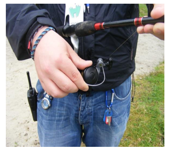
Opening the bail