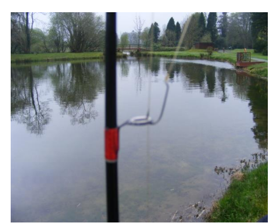
Clipping the hook to the rod's eye