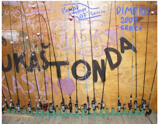
Fishing rod stand