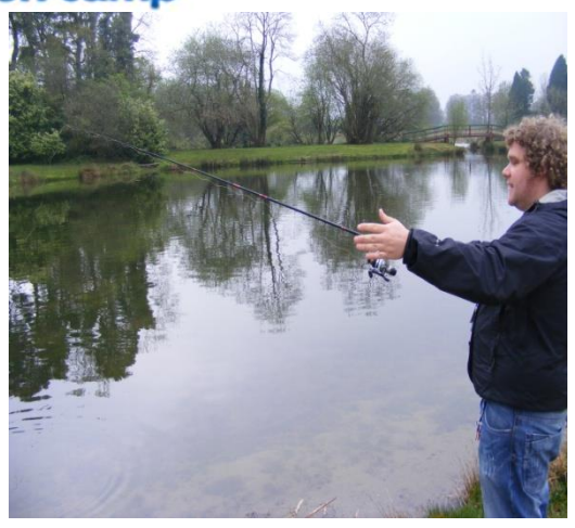
Cast over your shoulder