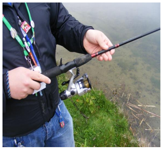
Holding line and rod

2. Casting – Now that the bait is in place we have to get it into the water. In order to cast out properly hold the fishing rod and the line in the same hand between the first eye and the reel. Place your other hand on the handle at the bottom of the rod above the reel. Open the bail to allow the line to cast out when your hand is released (The bail is the silver piece of hard plastic shaped in a semi circle which is on top of the reel. To open it, simply push it down). Check to make sure that there is nobody standing behind you or too close to you for the next part. Gently bring the rod back over your shoulder and when you are ready bring it forward and let go of the line and pole with the hand which was holding them. Never cast from behind your head. You should be watching your hook the whole time! Close the bail and sit tight with your bait in the water. Patience is the key here.