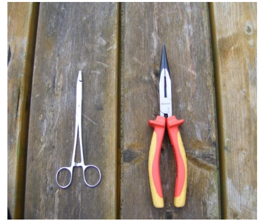
Fishing pliers for unhooking fish